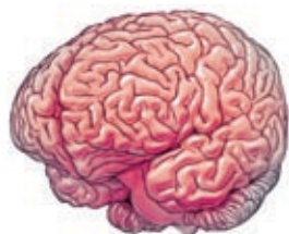
Human brain 1,350 grams