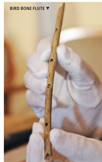
BIRD BONE FLUTE ▼

The archaeological record reveals that humans were routinely making art and musical instruments by 35,000 years ago, indicating that they were thinking symbolically by then. But modern scholars have no way of knowing what these long-ago people thought about the symbols they left behind nor how they composed their music. Such artifacts are thus of limited use in piecing together the origins of our unique mental abilities.