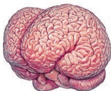
Killer whale brain 5,620 grams

Another simple tool, the telescopic, collapsible cup found in many a camper’s gear, provides